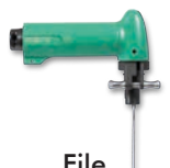
File FR5-827 - 020 000 730