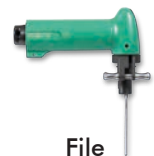
File FR5-827 - 020 000 730