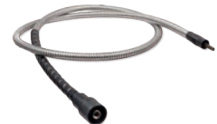
DV7 Flex 030 190 801