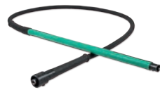
DV6 rigid 032 009 400