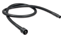
DV6 Flex 032 004 600